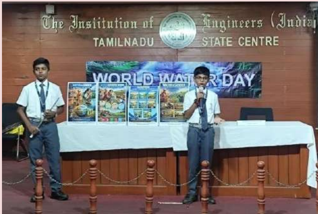
Poster Presentation by School Students