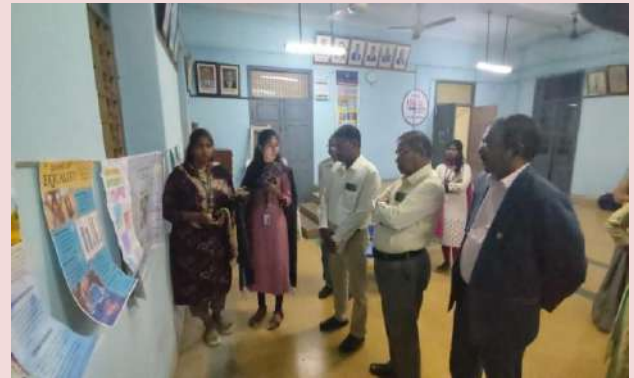
Poster Presentation by Students

respective institutions, and the final round was held at the IEI TNSC Auditorium on the day of the event. Winners were awarded cash prizes by the Chief Guest.