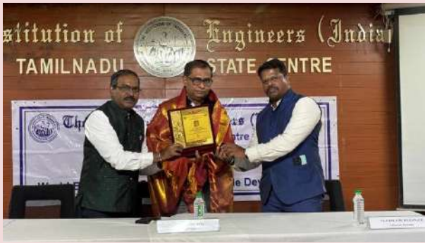
Honouring the Chief Guest