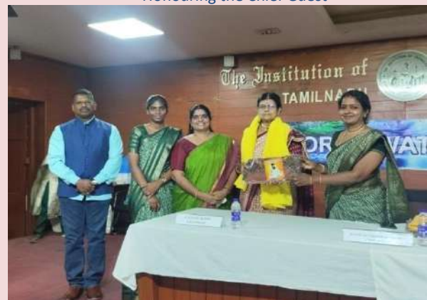
Honouring the Guest of Honour