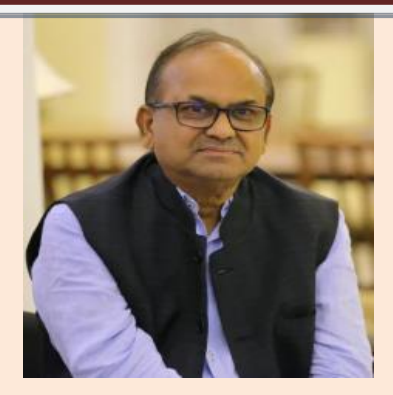
Dear Fellow Engineers,

It gives me immense delight to reconnect you all once again through this news desk.