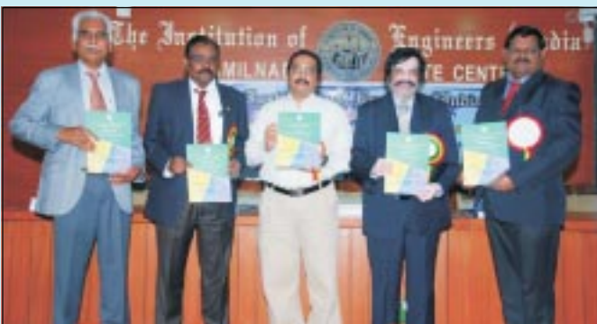
Dignitaries releasing the Souvenir and Compact Disc of 29th National Convention of Aerospace Engineers